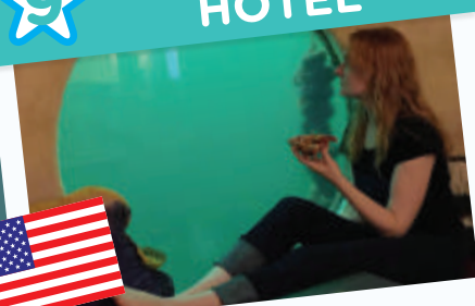
Jule's Undersea Lodge, United States of America

Underwater hotels are hotels with rooms built under water, where guests can experience sleeping with sea life. They are usually supported by the ocean floor, but there are also some hotels with rooms that are attached to a floating structure. 13