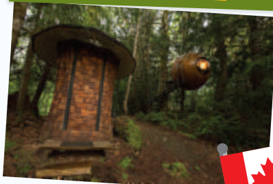
Free Spirit Spheres, Canada

Treehouse hotels are hotels perched high up in trees. Treehouse hotels may be supported by stilts of solid steel or suspended by a network of cables and ropes.