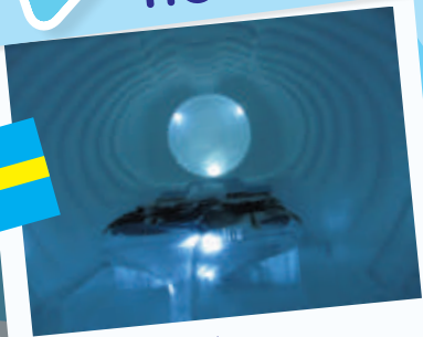
Ice Hotel, Sweden

An ice hotel is a non-permanent hotel constructed from ice and snow in areas with sub-freezing temperatures. Ice hotels are usually available during the winter months only. When spring comes, the ice melts and the hotels have to be reconstructed again in winter.