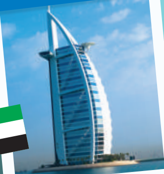
Burj Al Arab Hotel, United Arab Emirates

Skyscraper hotels are hotels built in very tall buildings that give guests an undisturbed view of the city below. Such hotels serve as instant visual icons in the city. 10 The rooms are often expensive and luxurious.