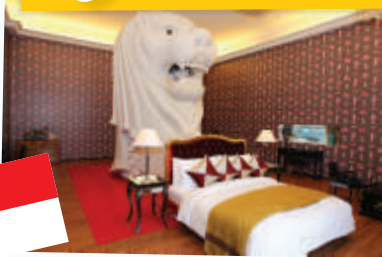
Merlion Hotel, Singapore

Pop-up hotels are temporary lodging establishments usually set up for a specific event. These hotels offer comfortable accommodation in unusual locations, but are only around for a short while. 7