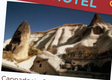
Cappadocia Cave Suites Hotel, Turkey

Cave hotels are accommodations built into natural formations, such as limestone cliffs and mountains. Some of the cave hotels used to be actual human dwellings that date back to thousands of years ago.