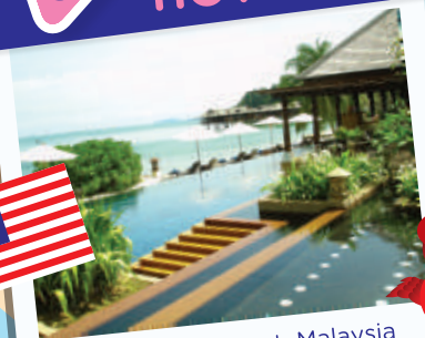
Pangkor Laut Resort, Malaysia

Resort hotels are usually located at the seaside, lake, or mountain areas. Resorts usually provide hotel services plus recreational and athletic activities that are available within the surrounding areas. 9