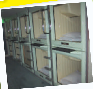
Capsule Hotel, Japan

A capsule hotel features extremely small rooms that are primarily for sleeping and nothing else. They are popular in Japan, where the rooms are referred to as "sleeping capsules". 2